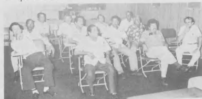
Twelve Mechanical Department employees successfully completed a course in Basic Electronics and Electricity.